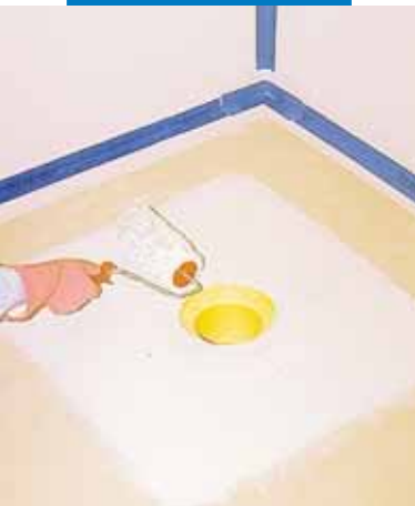
Spreading Mapegum WPS around the drain in a shower cubicle