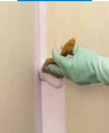
Applying Mapegum WPS with a brush