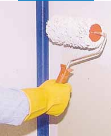
Applying Mapegum WPS on a wall with a roller