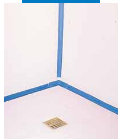
End result of a waterproofing treatment using Mapegum WPS and Mapeband