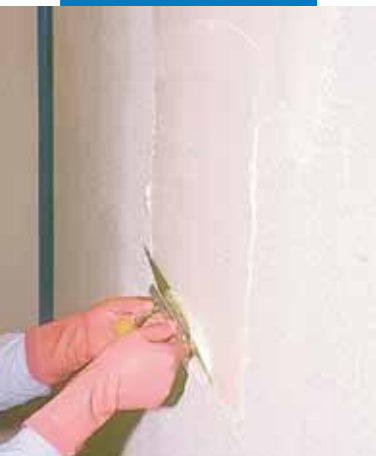
Spreading a coat of adhesive on Mapegum WPS