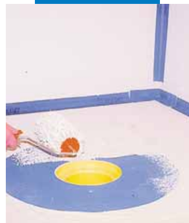
The special piece of Mapeband embedded in the Mapegum WPS