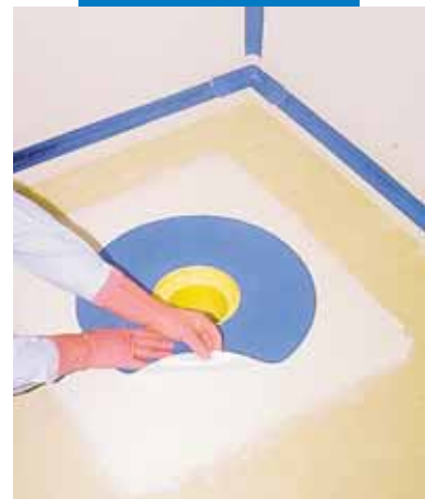
Positioning the special piece of Mapeband over Mapegum WPS

The consumption of Mapegum WPS is approximately 1.5 kg/m 2 per mm of thickness.