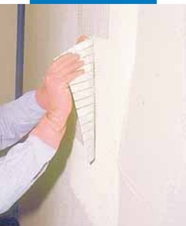
Laying glass mosaic