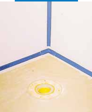
Bathroom wall waterproofed with Mapegum WPS and Mapeband